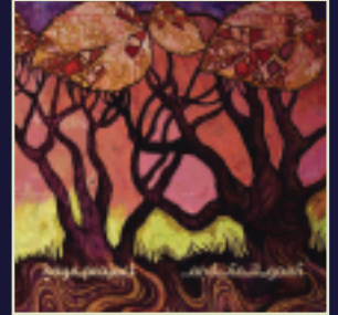
... and so it goes ichill cd 035

interchill / mariko music p.o. box 239, salt spring island, b.c. v8k 2v9, canada