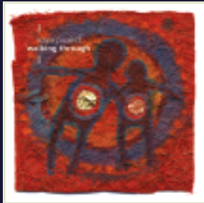
walking through ichill cd 017

all recent interchill releases can be found on major download stores and much of the current album catalogue is available for license to film, television and multimedia.